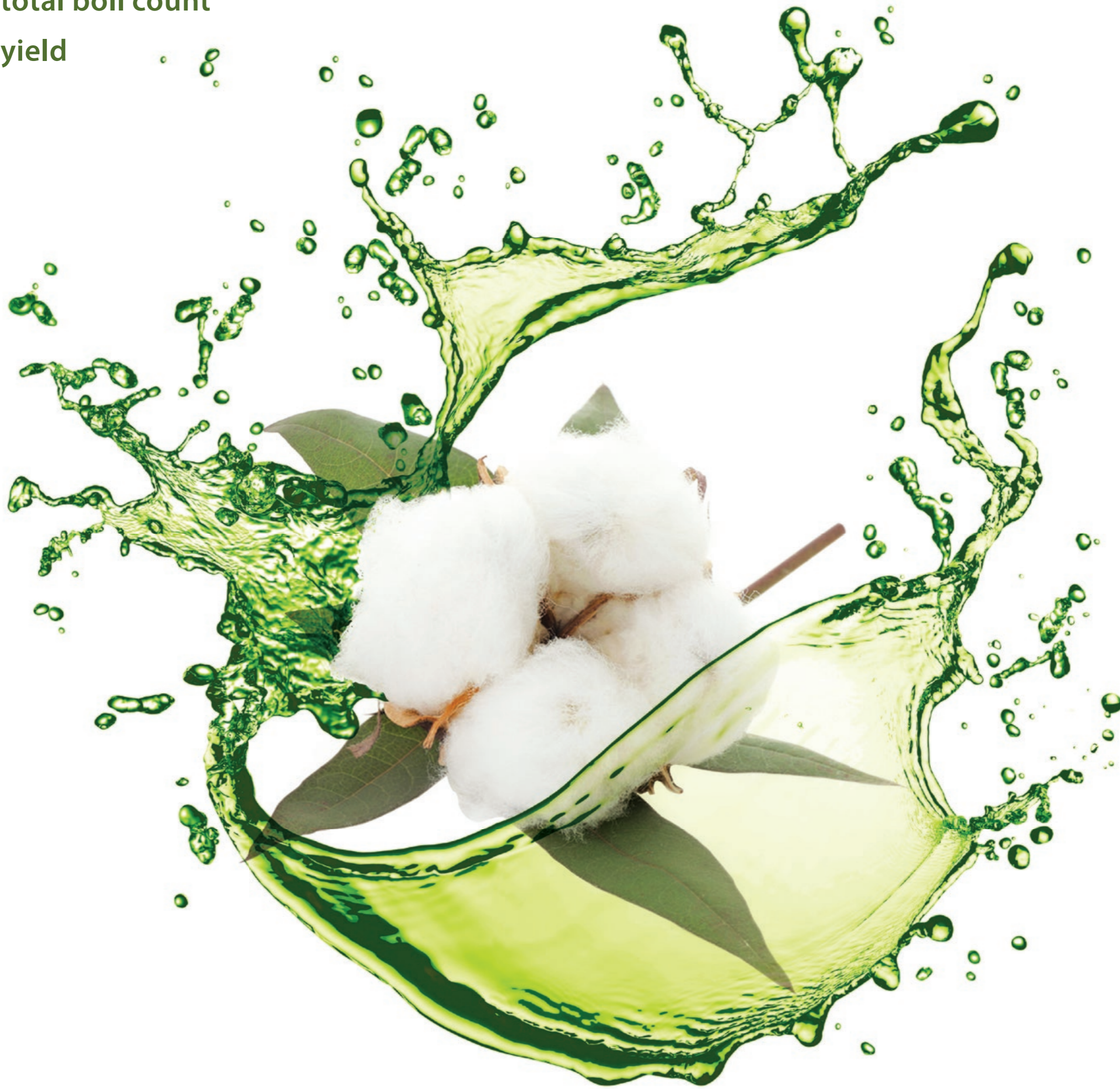
Response to Kelpak in Irrigated Cotton 2010-2011 and 2011-2012